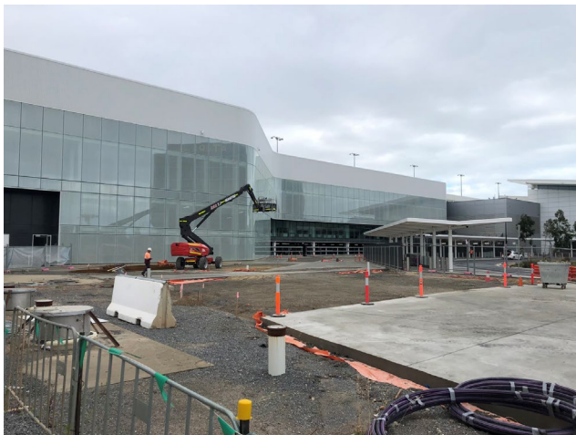
New northern forecourt construction