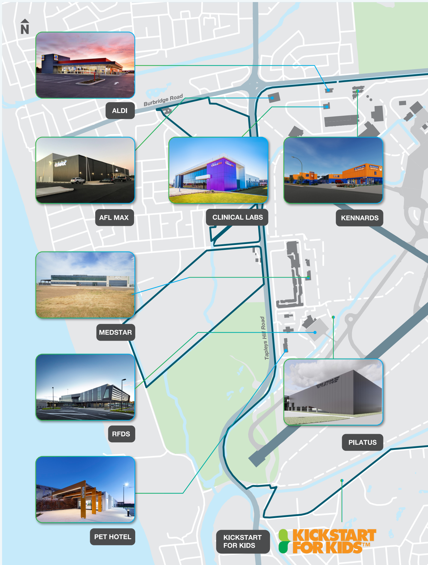
Figure 9-1: Location of Recent Commercial Developments and Activities