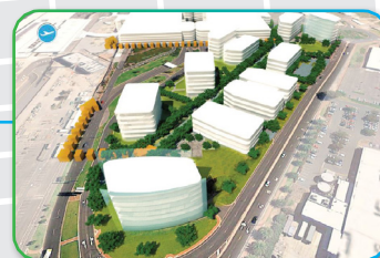
OFFICE PARK Planning and Development