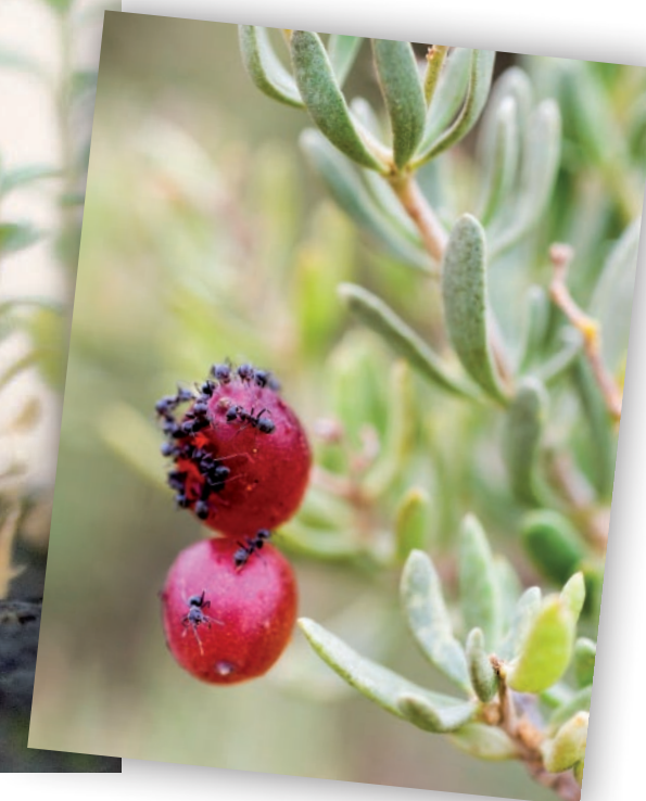
Ants feeding on Nitre Bush berries at Pat Creek Conservation Zone.