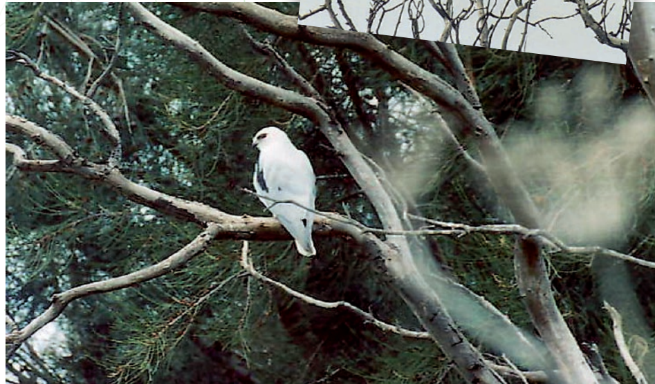
Black Shouldered Kites at Pat Creek Conservation Zone.

Dead trees are favoured perches for many hunting birds, as it gives them a high, safe place to rest and watch for potential prey. Their preferred habitat is treed grasslands.