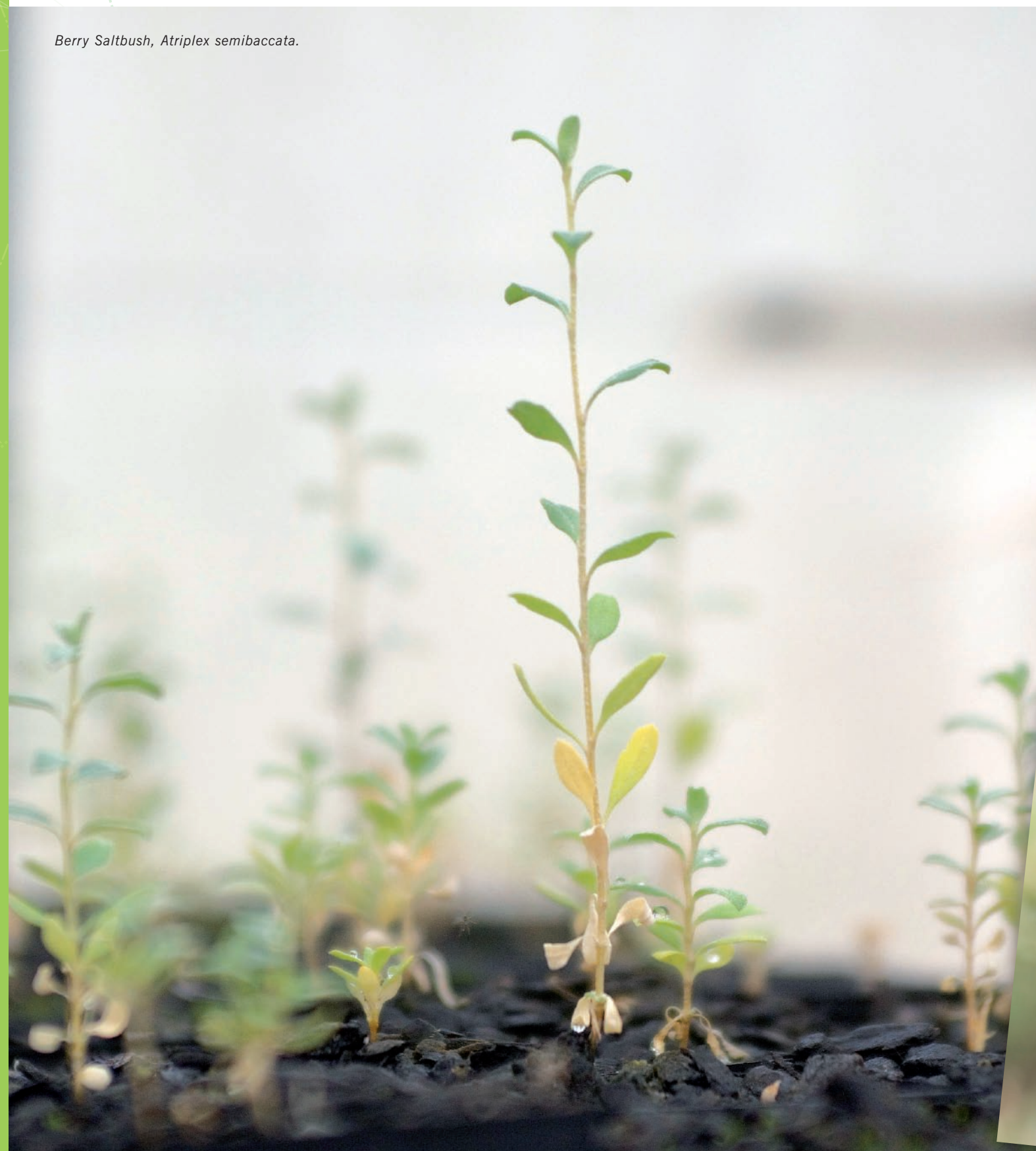
Berry Saltbush, Atriplex semibaccata.